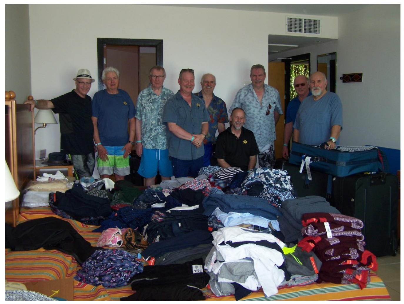
Sorting the donations into the suitcases before taking them to the lodges