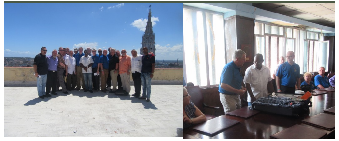
The Grand Lodge of Cuba in Havana