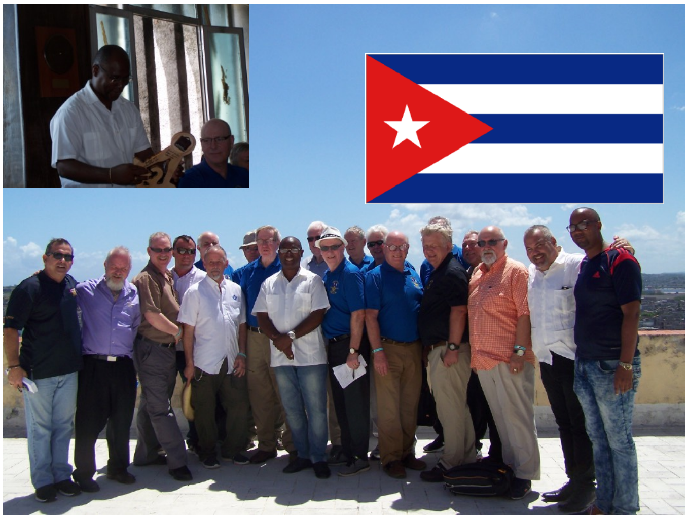
A Group photograph on the roof of the Grand Lodge building in Havana. Great views of the city from one of the highest buildings around.