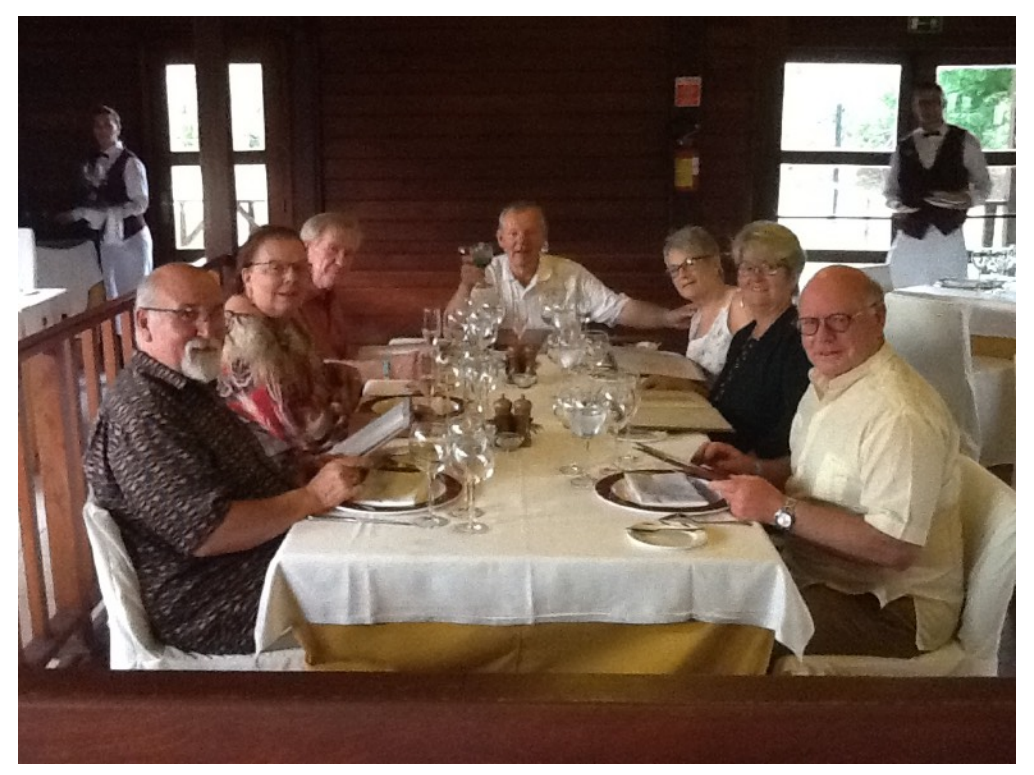
Dinner at one of the a la carte restaurants on the resort

Contact Pat Richards if you're interested in going at prichards@thedestinationexperts.com, phone 902-799-0011 or 1-866-899-8969 ext 408 or at the Grand Lodge office 902-423-6149.