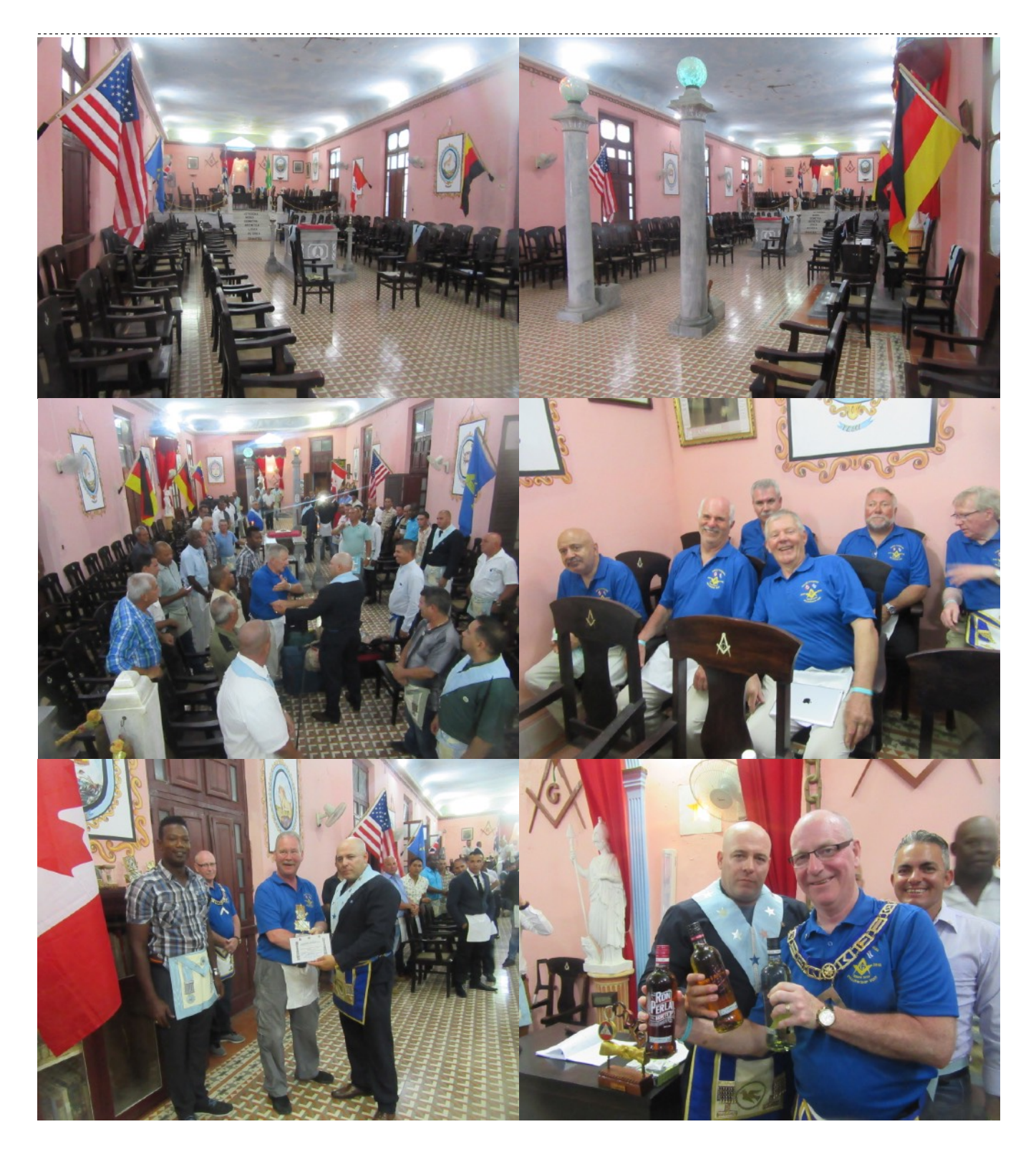
Cardenas Lodge where we received certificates and plaques of attendance and some local rum